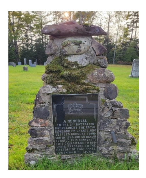
Monument to 84<sup>th</sup> Regiment, 2<sup>nd</sup> Battalion

To view a video on YouTube that I prepared during my visit to the monument see: https://youtu.be/pv_0p-v1Gwo?si=-_w7VcYuxdhYt1D9