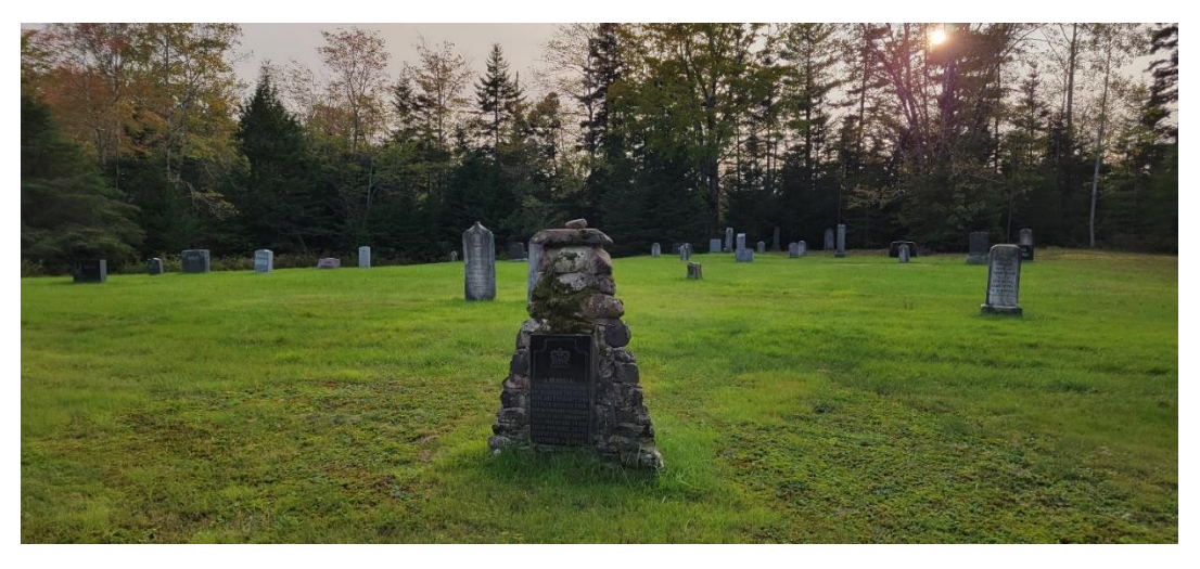
Saint Thomas Cemetery with Monument at front

There is a unique loyalist monument located in Hants County, Nova Scotia which I visited in September, 2023. It is the only monument in Canada built by descendants as a tribute to a Regiment that served with the British during the American Revolution. It is located in the Saint Thomas Anglican Church Cemetery on the Georgefield Road.