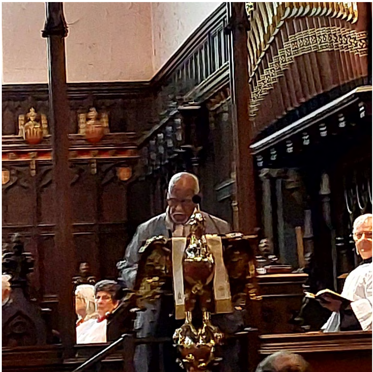
Marching Out Following the Service