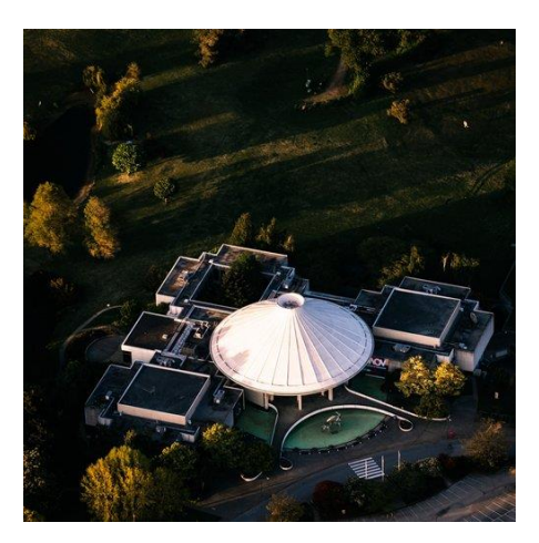
Museum of Vancouver- Vanier Park

"We acknowledge that MOV is located within the unceded, ancestral territories of the x<sup>w</sup>məθk<sup>w</sup>əy'əm (Musqueam), Skwxwú7mesh (Squamish), and səlilwətał (Tsleil-Waututh) Nations." ("MOV | Museum of Vancouver")