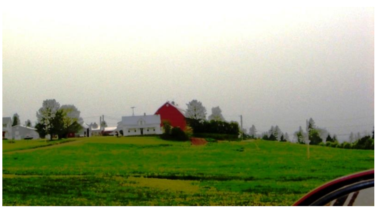
Sharp Homestead Lower Millstream, Kings Co., NB 200 years old Est 1785