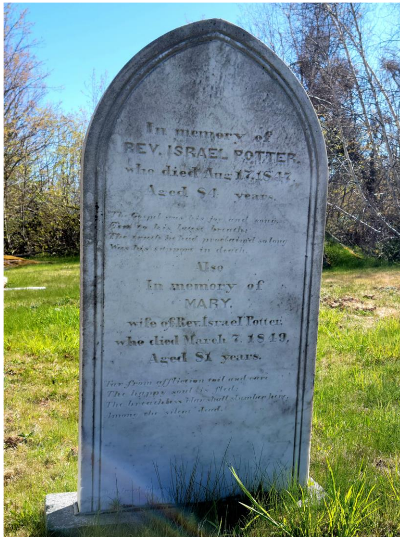
Headstone for Reverend Israel Potter (1763 – 1847) & wife Mary

Israel Potter, son of Joseph Potter, Jr., later became a minister in the Baptist Church. He was buried in the Goat Island Baptist Church Cemetery, which is located in Upper Clements.