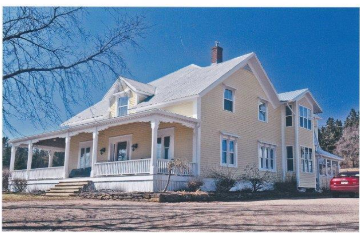
FOX HILL HOUSE - Saunders - Allaby April 6, 2016