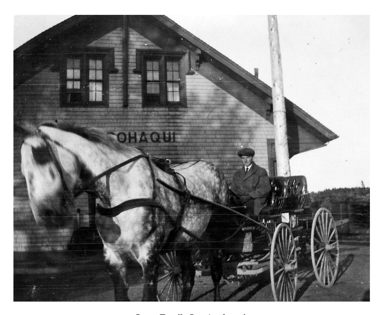
Jones Family Inn Apohaqui