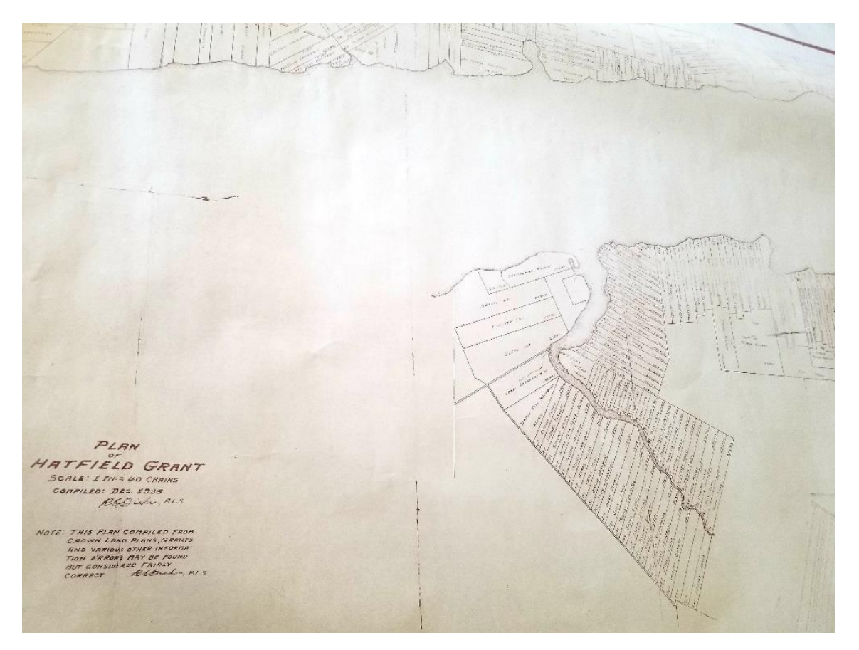
Plan of Hatfield Grant

The Hatfield Grant consisted of 91,632 acres. As by the time some people had settled on lands which created further problems and a large grant was made to Isaac Hatfield and five others. It included the north, south and middle ranges, each one and a quarter mile in width, from north to south, and extending westwardly to the Sissiboo River, amounting to some 65,0000 acres. The area of the Hatfield Grant was designated by the name of the Township of Digby and there were conditions attached to land received by each person. These required each Grantee to: